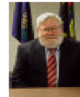
Mayor Bernard Bowling Jr.